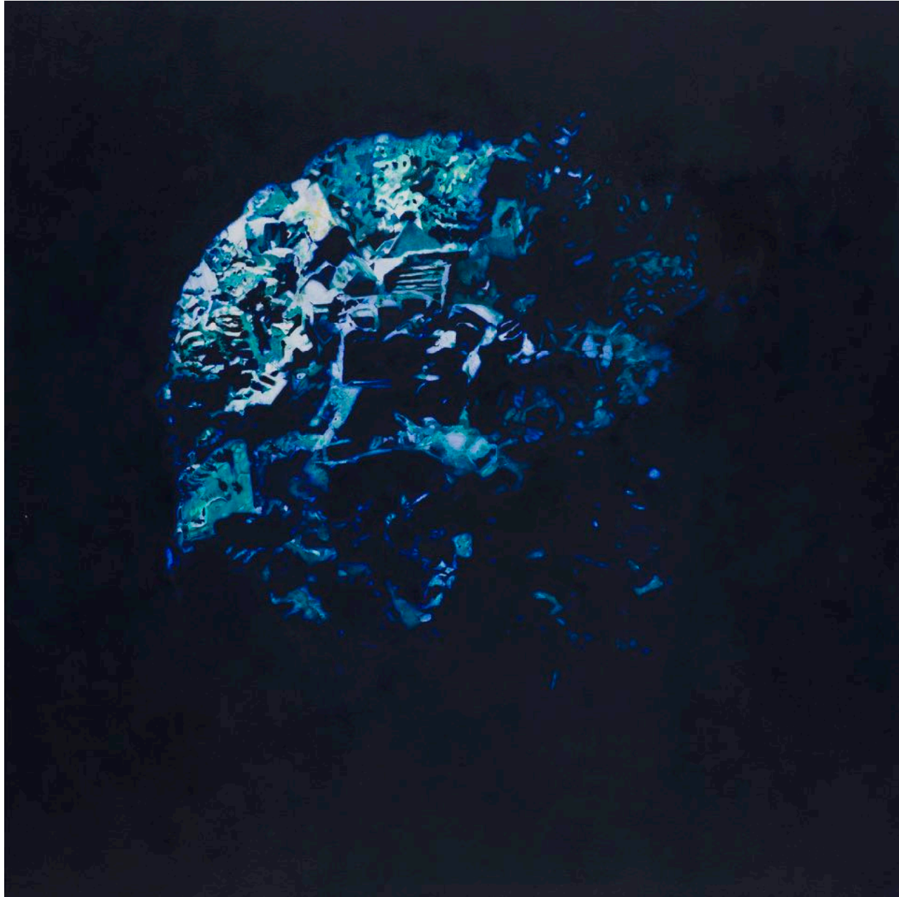
We're all going down together, 2022 Oil on canvas, 100 x 100cm