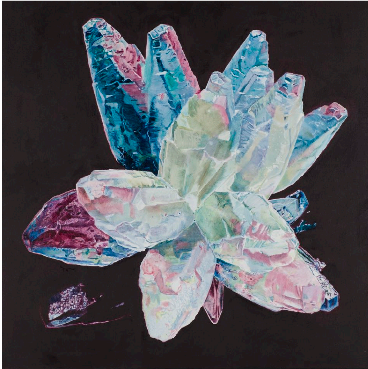
Until I remember that you've gone 2022 Oil on canvas, 100 x 100 cm, private collection