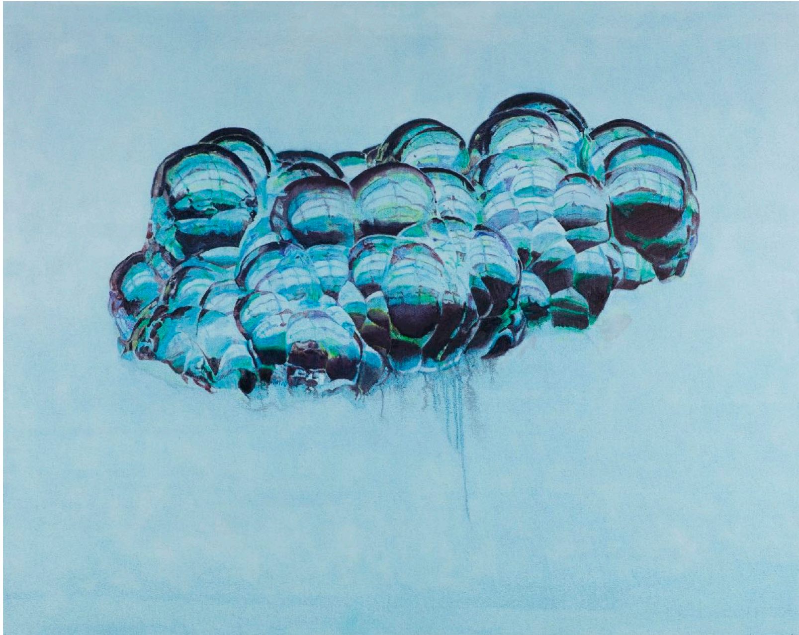
And if only I could 2023 Oil on canvas 100 x 100 cm