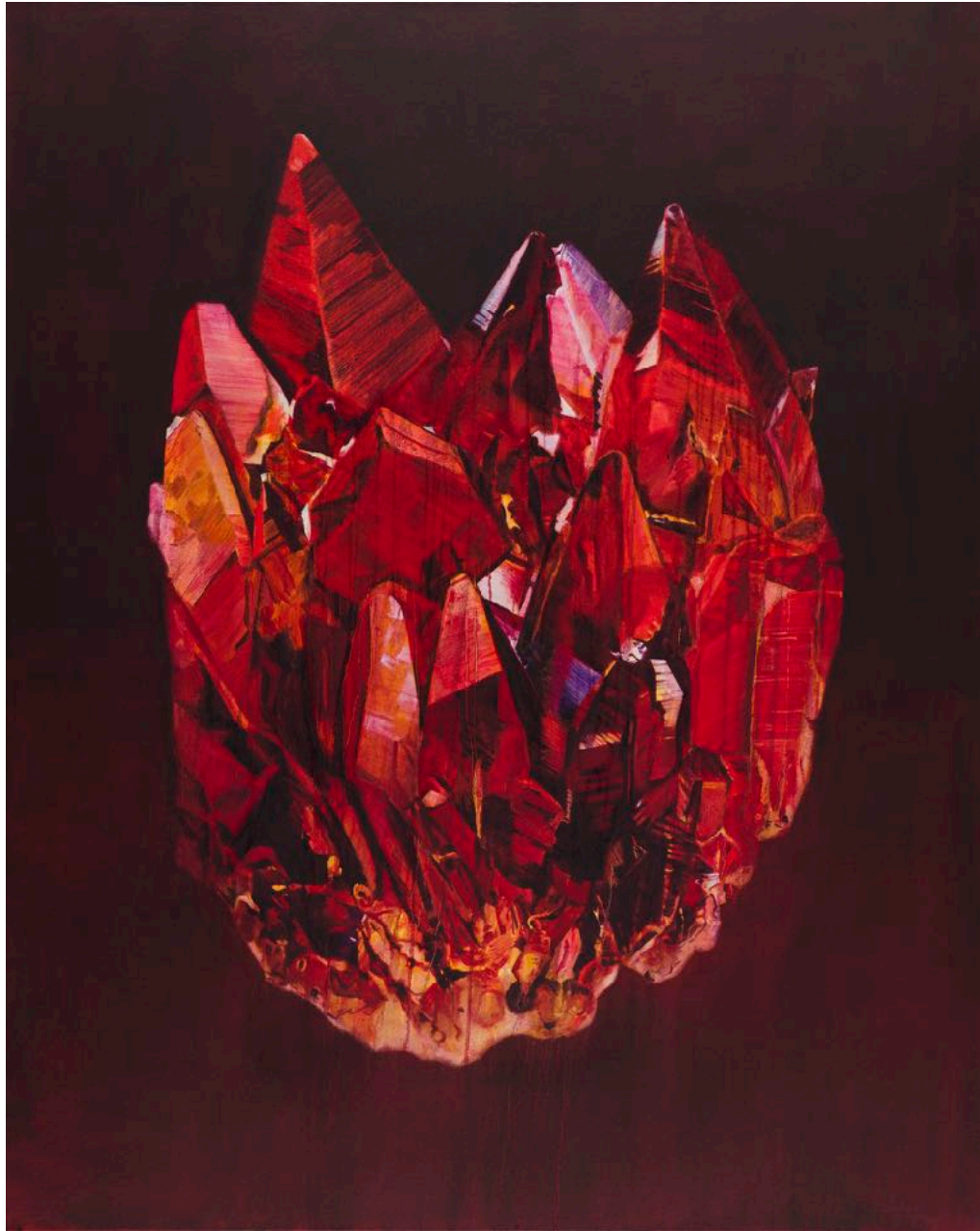
Keep me in a dream, 2021 Oil on linen, 150 x 120 cm, private collection