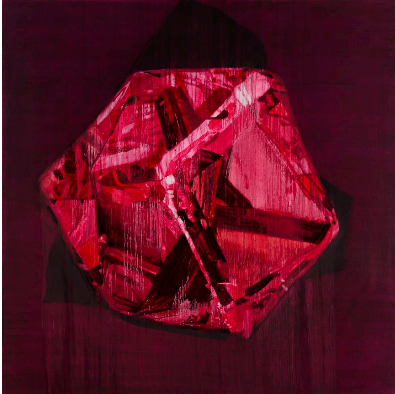
Maybe if I fall asleep, 2022 Oil on linen, 120 x 120 cm