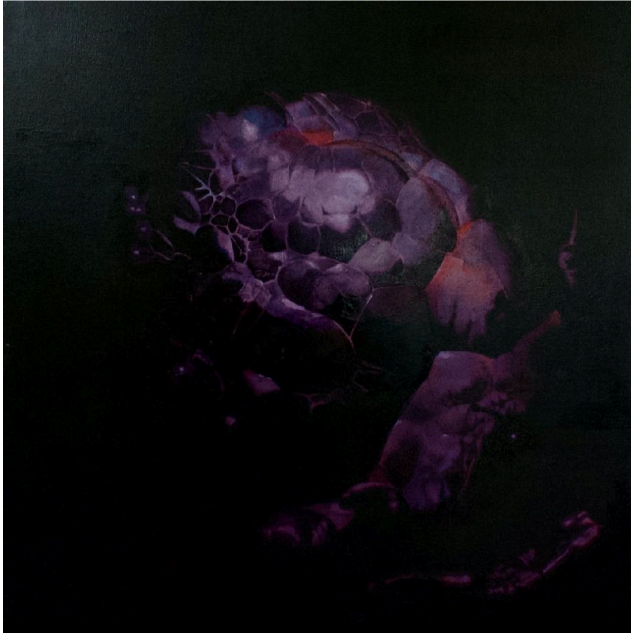
She's in love (in her own mad mind), 2020 Oil on canvas, 100 x 100 cm