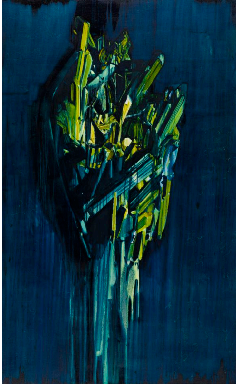
I will lead you (out of here) 2019 Oil on canvas, 160 x 100 cm