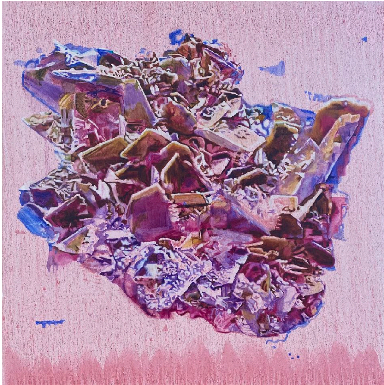
There will be no peace, 2024 Oil on canvas, 100 x 100 cm