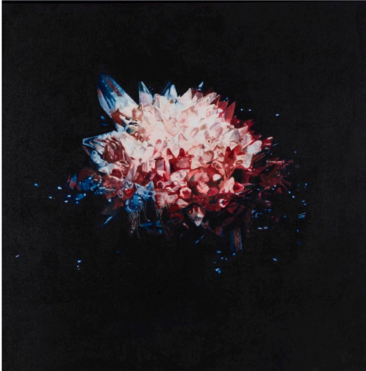
All these silent moments, 2020 Oil on canvas, 100 x 100 cm