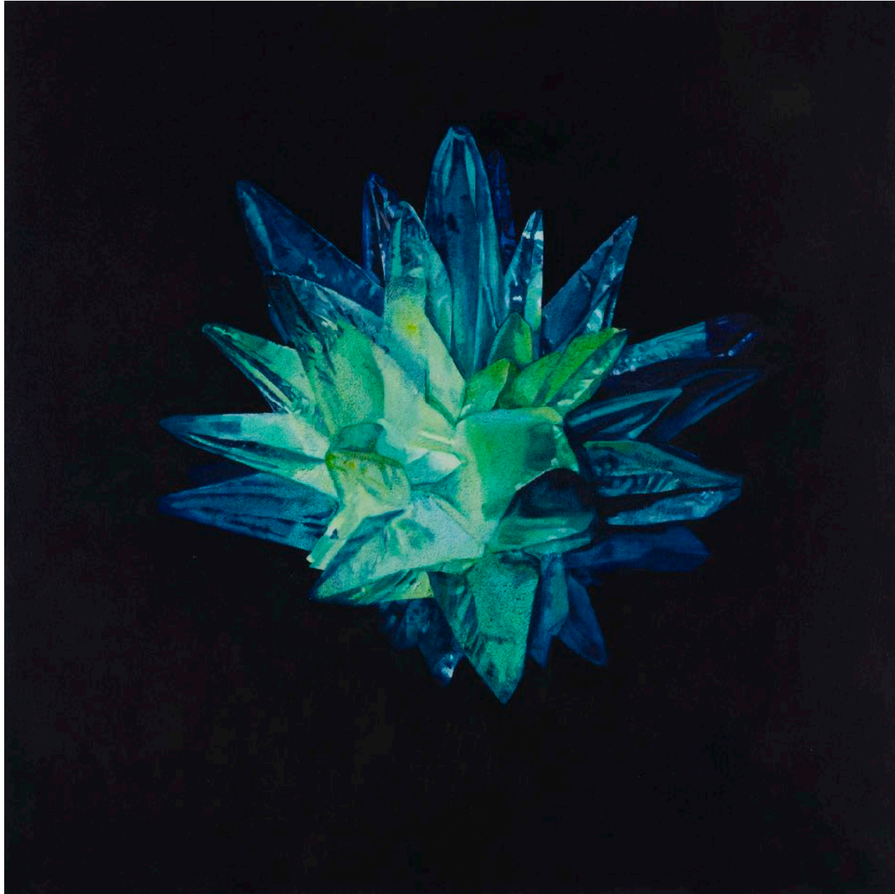
And blazed through the sky, 2020 Oil on canvas, 100 x 100 cm